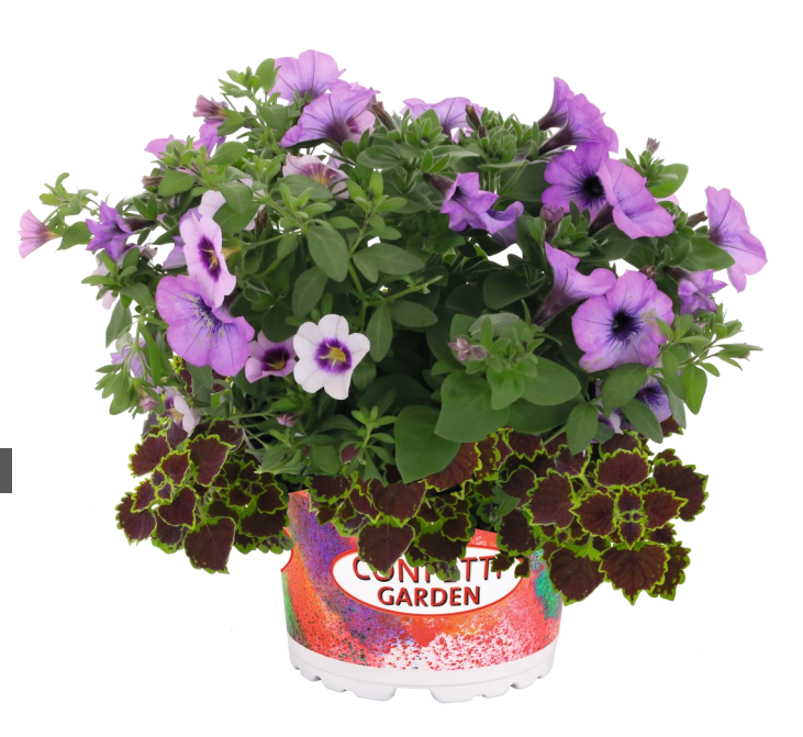
'Still Water Safari'