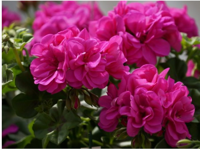
Great Balls of Fire® Blue