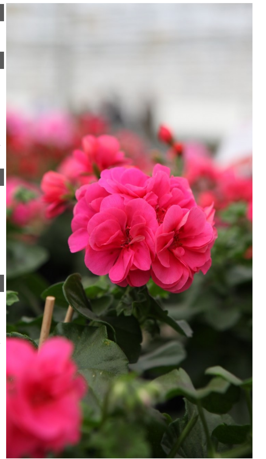
Great Balls of Fire® Pink