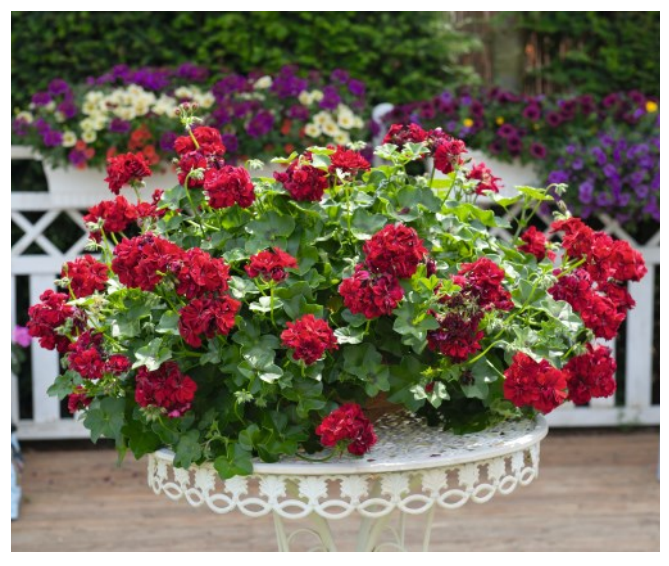
Great Balls of Fire® Merlot