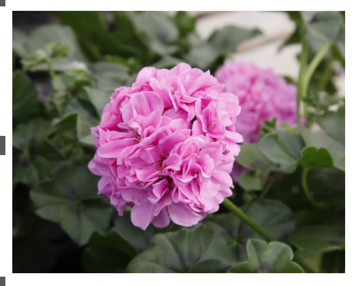
Great Balls of Fire® Lilac