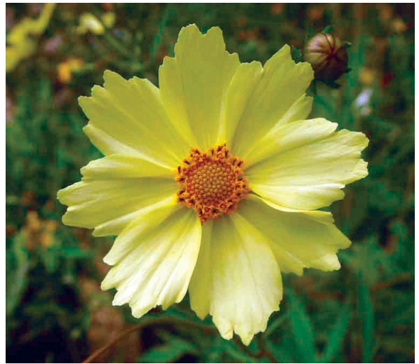
'Full Moon Imp'