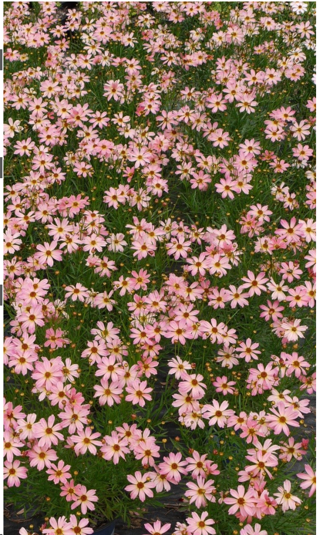
'Shades of Rose'