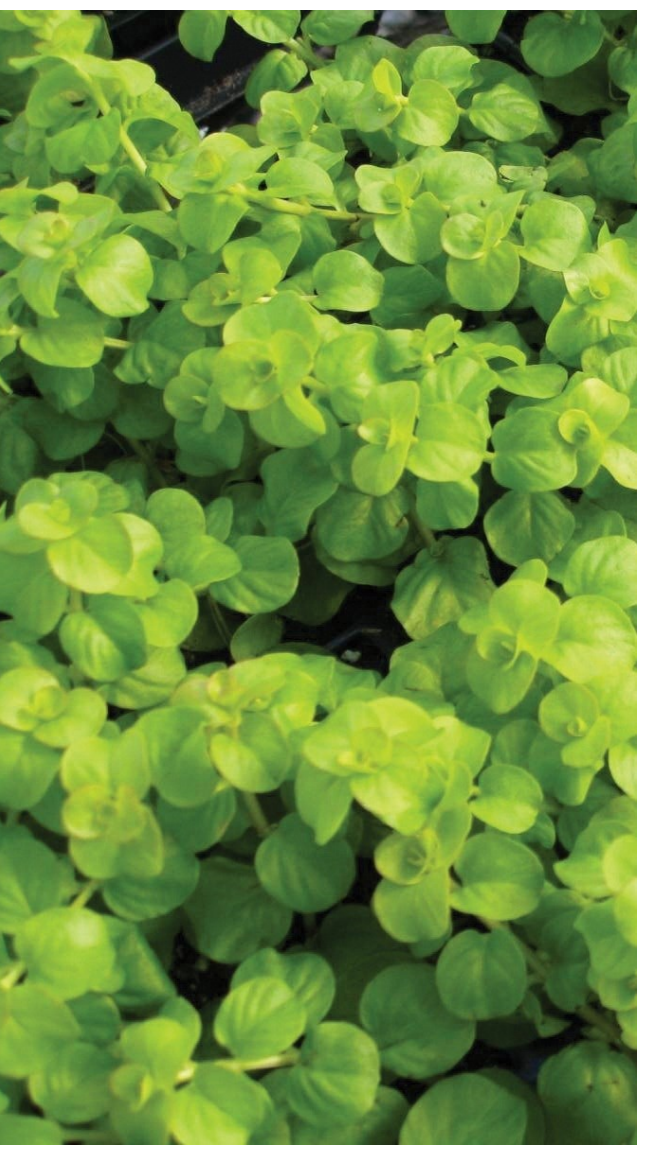
'Creeping Jenny Green'